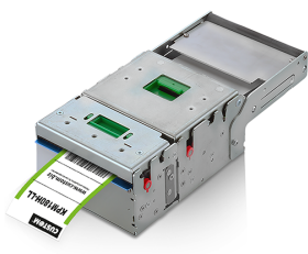
915AH030700700 PRINTER KPM180H-LL UHF RFIDCUT PRES ETH USB RS232 AVIATION

Via Berettine, 2 - 43010 Fontevivo PR - VAT: IT02498250345 - TEL: +39 0521 680111 - FAX: +39 0521 610701 - UNIQUE CODE: 8RQN7AZ